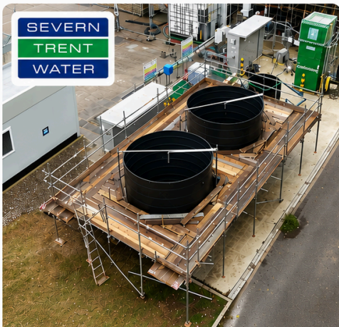
In-line water utility