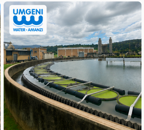
Retrofit water utility