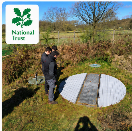
Decentralised in-field installation