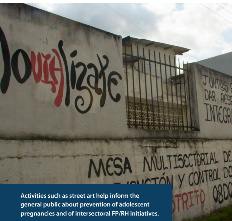
Activities such as street art help inform the general public about prevention of adolescent pregnancies and of intersectoral FP/RH initiatives.

WHO. (2011). WHO guidelines on Preventing Early Pregnancy and Poor Reproductive Outcomes Among Adolescents in Developing Countries. Geneva: World Health Organization. http://www.who.int/maternal_child_adolescent/documents/preventing_early_pregnancy/en/