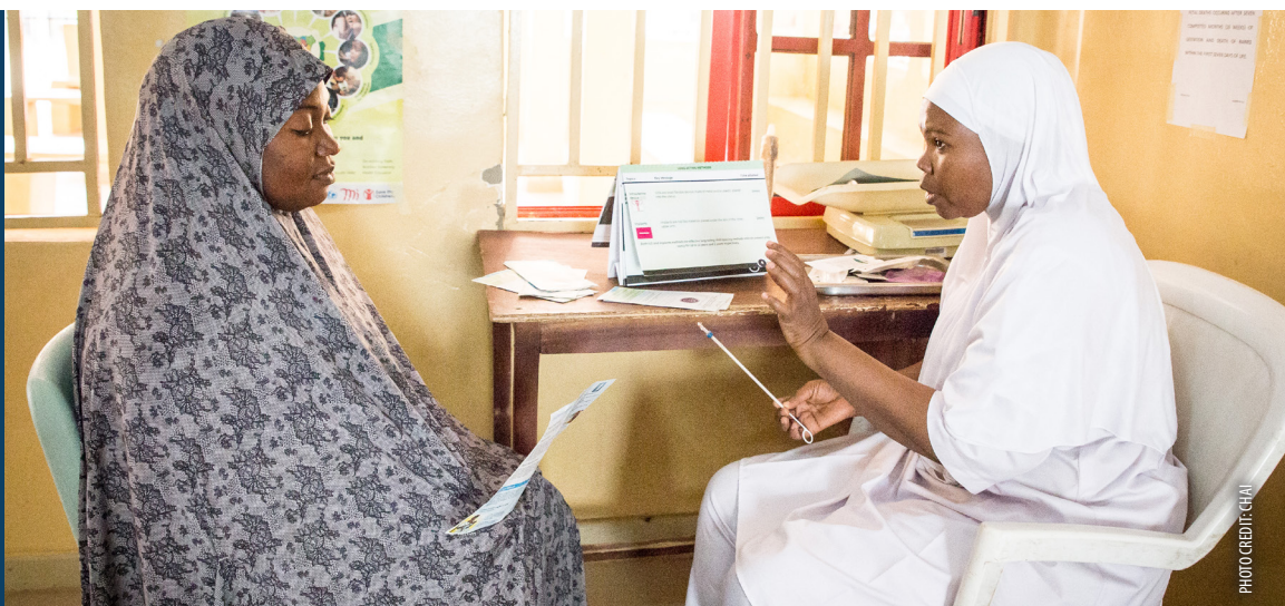
Nurse counseling mother on family planning options.