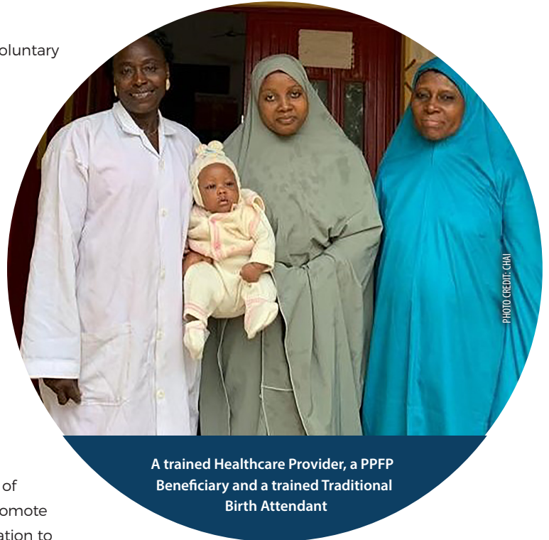
A trained Healthcare Provider, a PPFP Beneficiary and a trained Traditional Birth Attendant

These joint efforts led to an increased proportion of women receiving antenatal care—from 10,320 clients attending their first antenatal care visit in 2016 to 34,527 clients in 2019. In addition, 146,833 women from 374 target facilities chose and received voluntary postpartum family planning immediately after delivery—58,683 for postpartum intrauterine devices and 88,742 for postpartum implants—helping them to safely space their pregnancies. This represents significant growth in the uptake of voluntary postpartum family planning in target areas where such services at facilities were rarely available at baseline. In fact, by the end of the program, 30 percent of women delivering at program facilities across the three states received immediate voluntary postpartum family planning, and 100 percent of women attending antenatal care visits were counseled on postpartum family planning. Due to the strong community-led demand-generation approach, by the end of the program, more than 25 percent of women who received an immediate voluntary postpartum family planning method were women who delivered at home and were referred to the health facility within 48 hours. For those who delivered at home—up to 80 percent on average—the participation of volunteer drivers made it possible for them to access postpartum family planning immediately following home delivery.