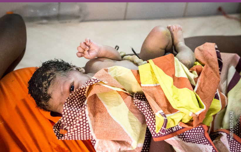
Trained health care worker assisting a delivery.