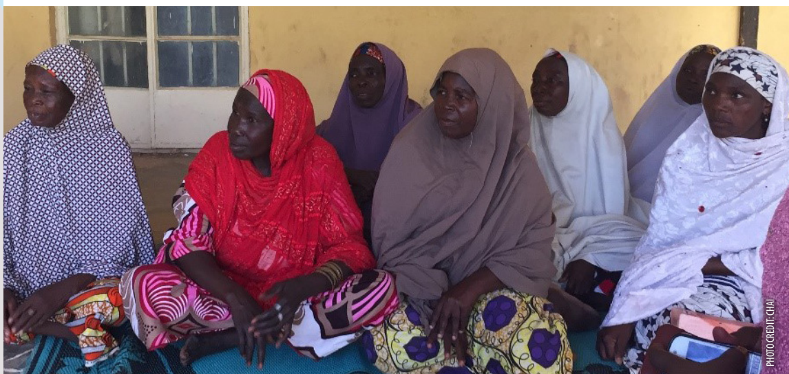
Traditional Birth Attendants (TBAs) during a sensitization meeting.