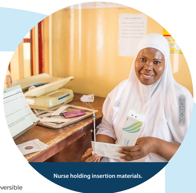
Nurse holding insertion materials.

Expanding access to long-acting reversible contraceptives provides women the choice of more options, including more effective methods to reduce unintended pregnancies and associated negative health outcomes. Providing long-acting reversible contraceptives during the postpartum period is an even more effective intervention as it provides women with voluntary family planning when they need it most and when the health benefits are greatest. However, only 3 percent of postpartum Nigerian women use contraception within six months after delivery (Track20, 2016).